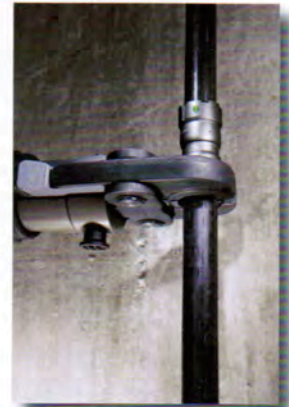
New Products 29